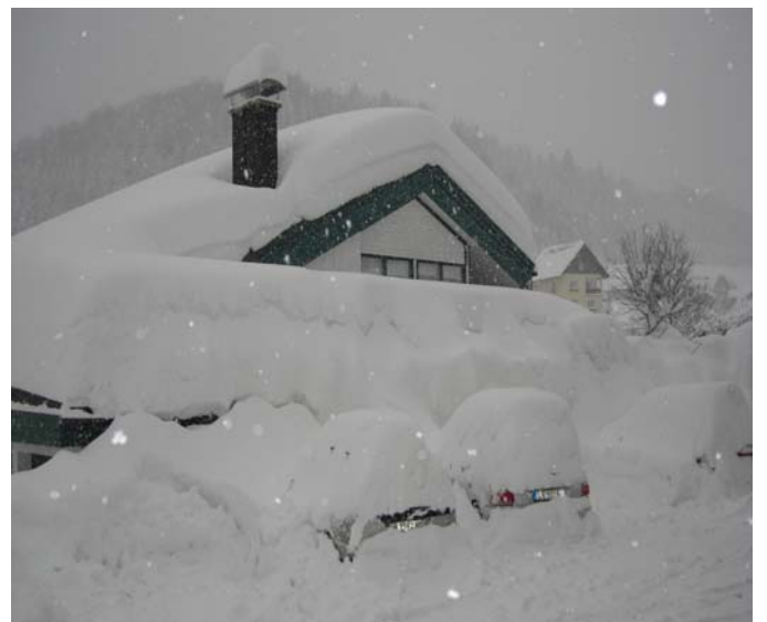
A buried village