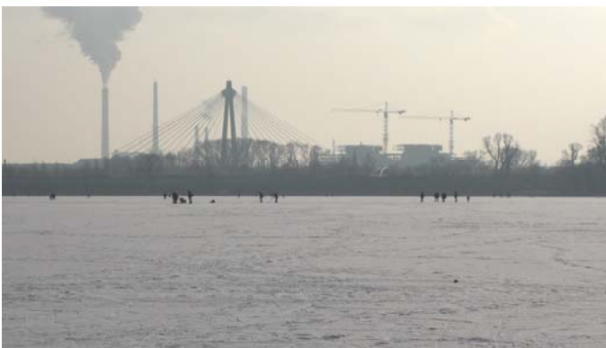
The Alte Donau

An OzCon outing on the ice at Wiener Eislaufverein near Stadtpark was followed by the mandatory Viennese coffee and cake.