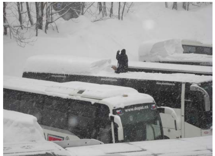
Clearing snow off the buses