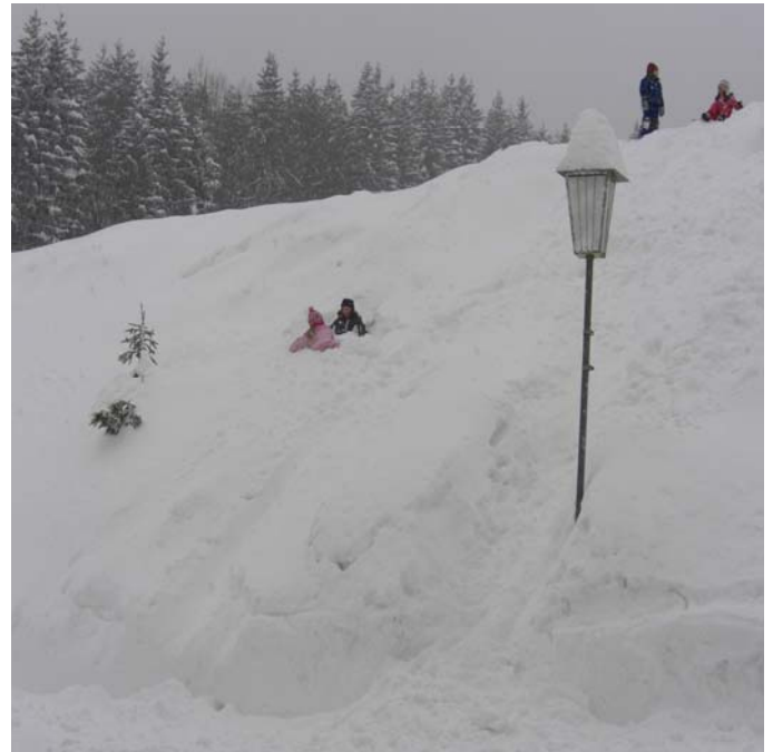
A mountain of snow: half a metre per day