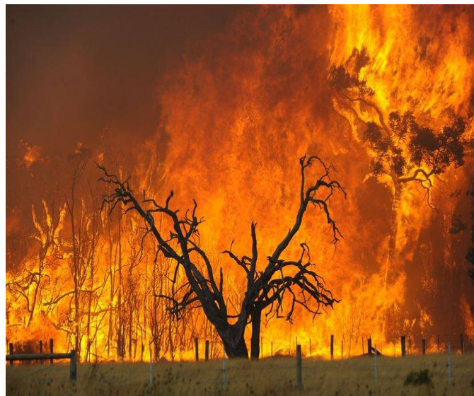
No stopping an inferno

The response by Australians to tragedy has been overwhelming yet again following the launch of the 2009 Victorian Bushfire Fund to assist individuals and communities affected by the devastating bushfires. The website for donations is: www.redcross.org.au