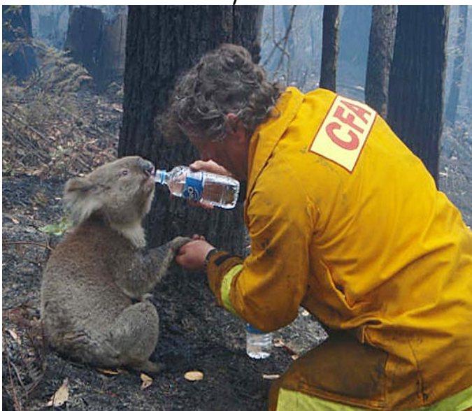
Fireman: "How much can a koala bare?"