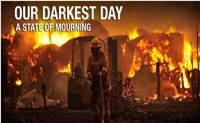
OUR DARKEST DAY A STATE OF MOURNING