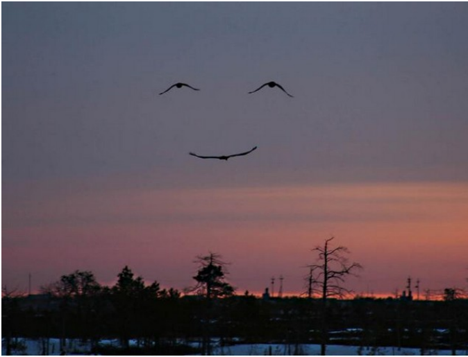
A winter smile