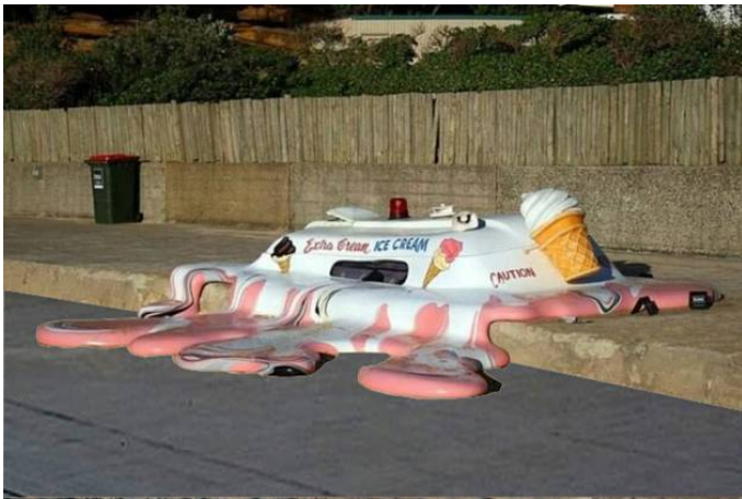
It's been pretty hot in Adelaide recently